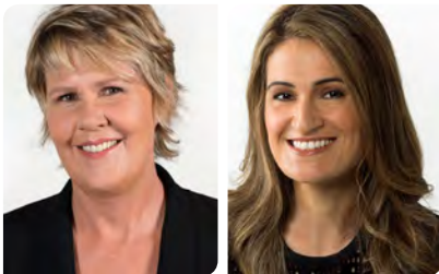
Left to right: Fran Kelly, Patricia Karvelas.